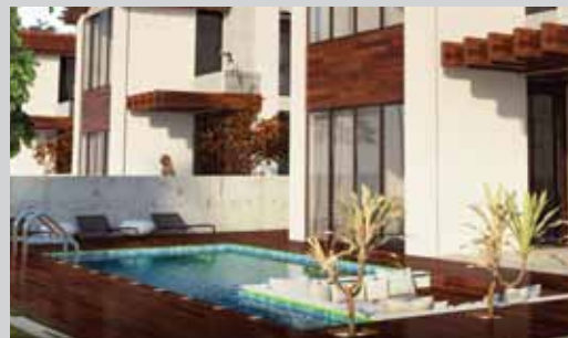
TYPE D/4 BEDS 四居室 D型