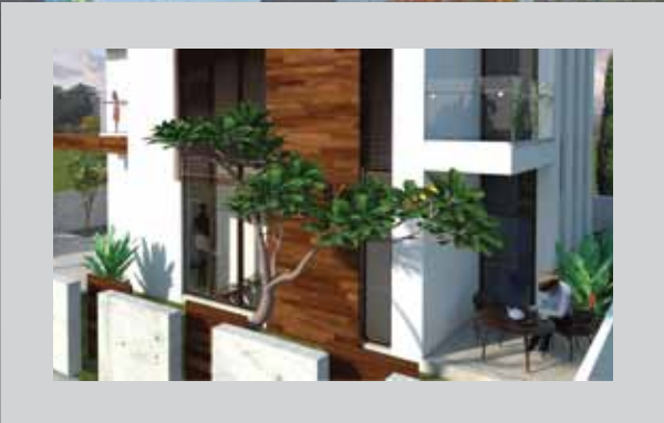
^ FIRST FLOOR 一层